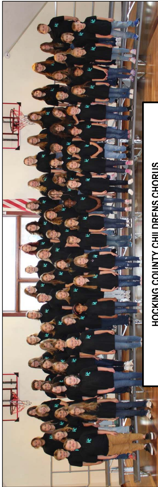
HOCKING COUNTY CHILDRENS CHORUS 2023 - 2024